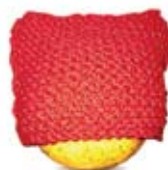
This hat is made from two 4 x 5 inch rectangles.