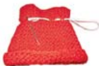
Hat A Tube hat with gathered top.