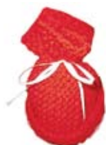
Gathering the top This hat is made from one 5 x 10 inch rectangle.